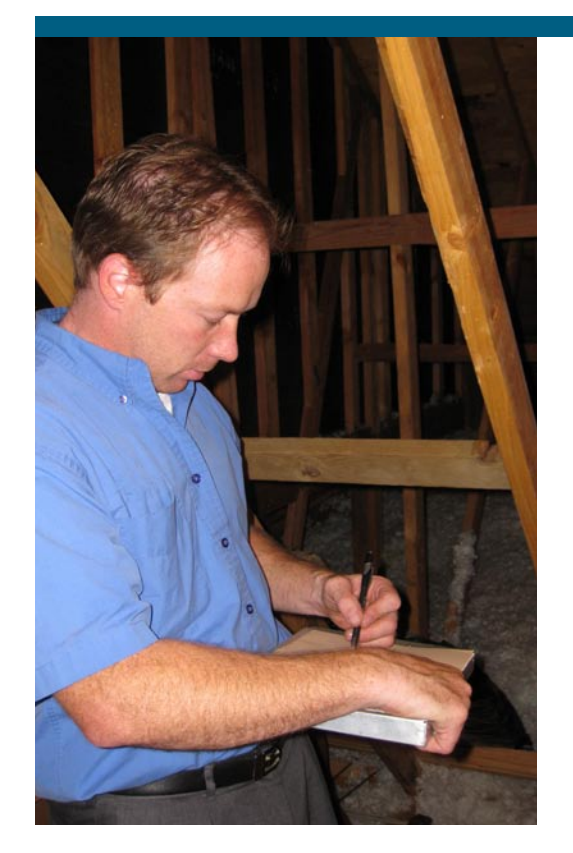
Certified contractors are trained in building science principles to know the safest and most effective ways to improve your home's energy efficiency.