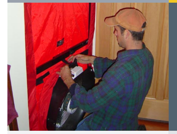
BUILDING AMERICA BEST PRACTICES SERIES